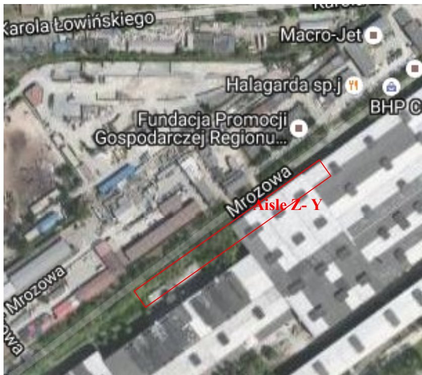
Fig. Location of the project