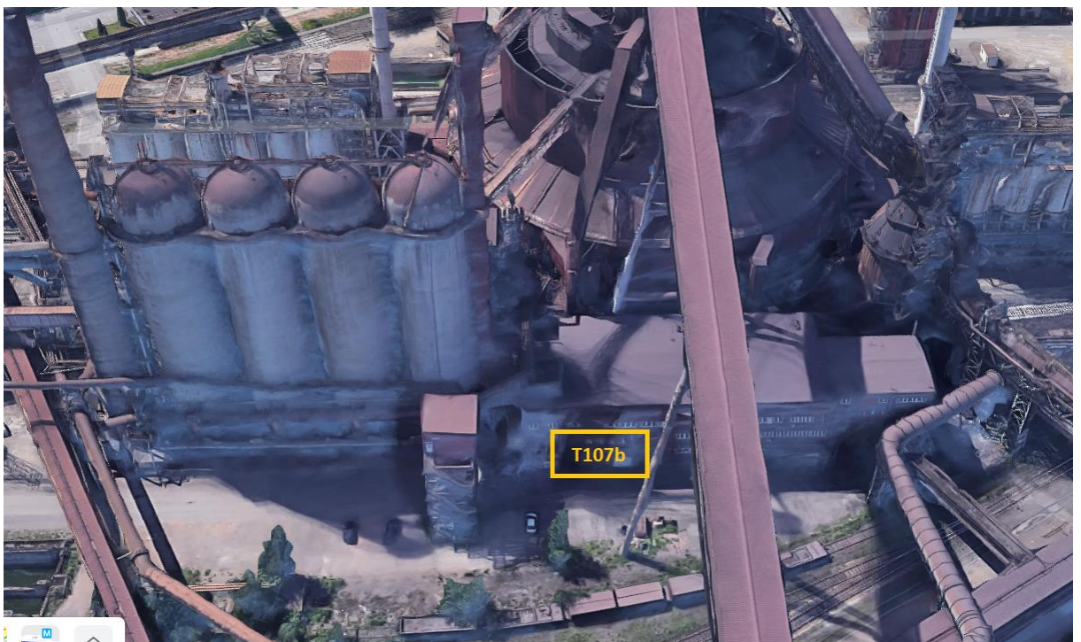
Fig. 0.4kV T107b switching station