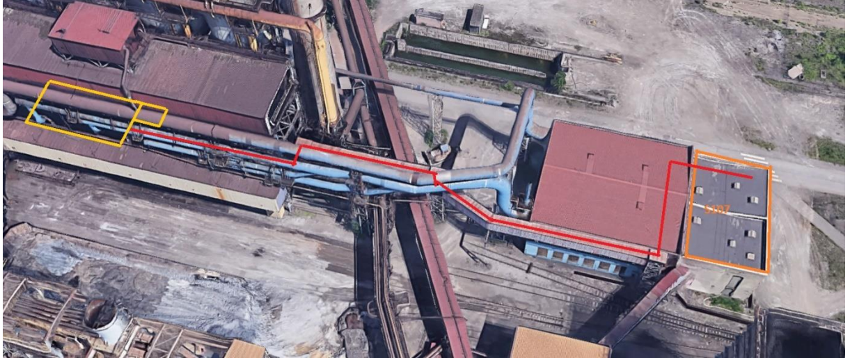
Fig. MV cable routing between S107 and the new pump house